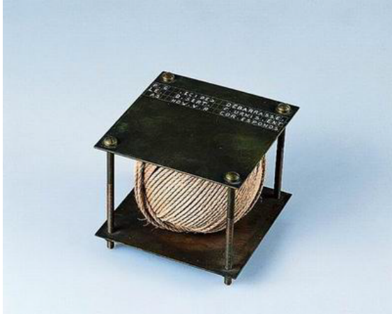
Marcel Duchamp's With Hidden Noise , 1916