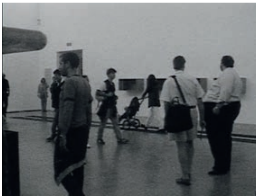
Sarah Rapson, "Cathcart Hill," 2000, film still

The slightly curved black canvas of My Dress (2004), the earliest painting in the show, makes the point most poignantly. At 48 inches long and 14 inches wide, its size could roughly match a black dress worn by Rapson: a painting as something you wrap around yourself, as a decoration of the self, an accessory to one's identity. On second glance, though, or seen from the side, the work turns out to actually consist of two joined canvases, thus breaking the one rule a dress is defined by – that it's a one-piece garment (otherwise it's a skirt). Why cut what is one in two? Why split the organic identity into two unequal parts to then reassemble them in a curve?