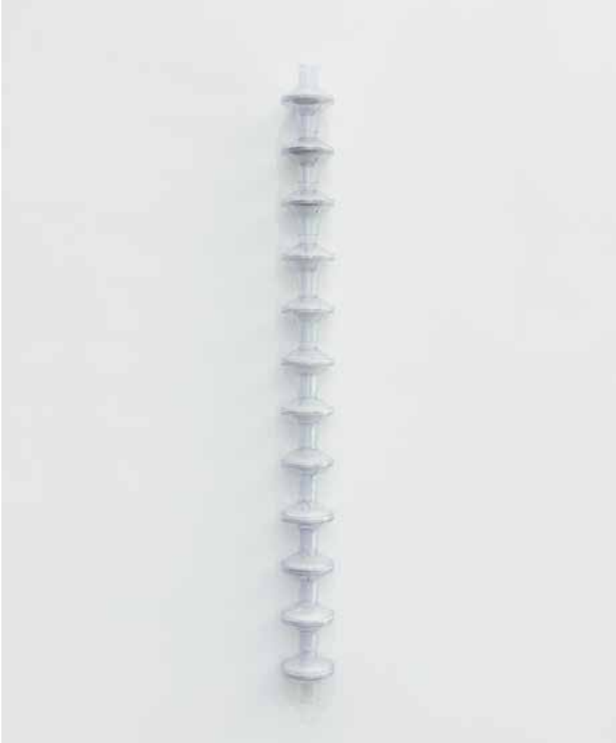
Opposite page: Park McArthur, Form found figuring it out, show, 2020 , two pages, installed according to options. Installation view, Kunsthalle Bern, Switzerland.